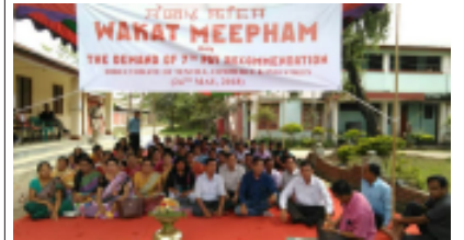
IT News Imphal, May 24,

JAC of AMTUC and AMGEO strikes enter 64 days