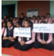
IT News Imphal, May 24,

Protest against rape of minor girl; protestor demand hang to death of the rapist